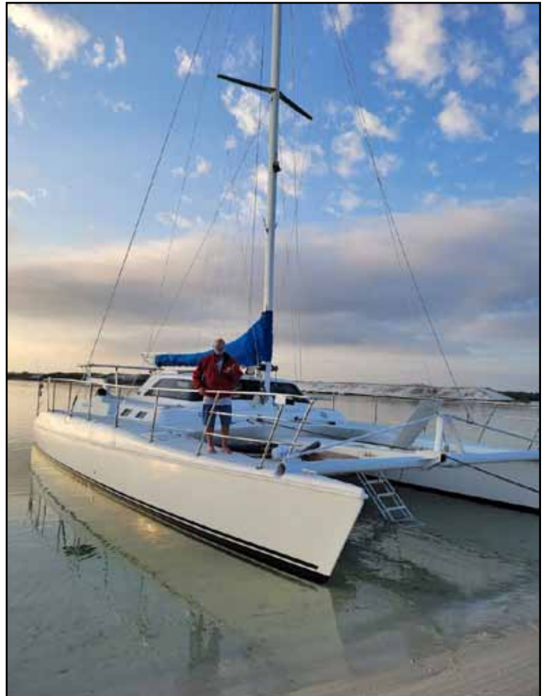
Above: Out of the ICU and back to the open ocean.

"I joined Sigma Nu because the guys had similar interests and backgrounds to my own." My intention after graduation was to return to Hawaii and become an architect. The op-