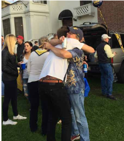
Below: Alumni tailgating on gamedays