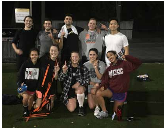
Above: The IM Soccer team