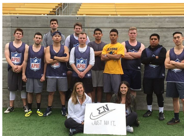
Right: Alpha Phi flag football tournament team plus coaches